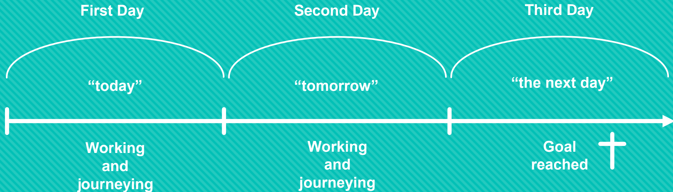
The three days in Mark 13:31-34