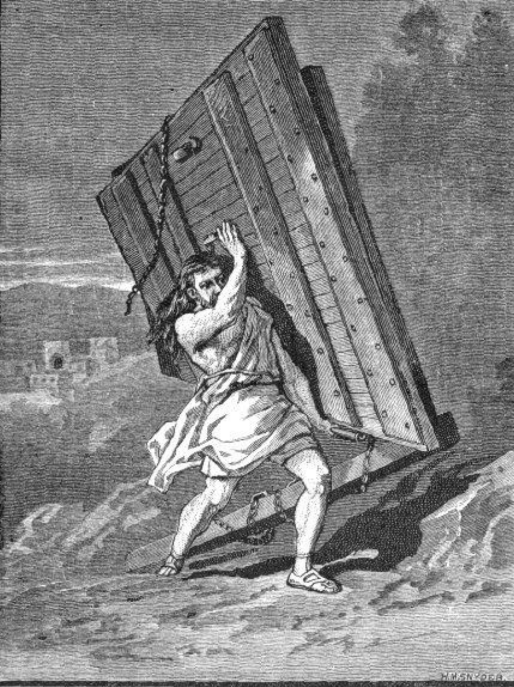
SAMSON CARRYING THE GATES OF GAZA.